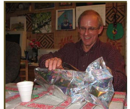
Fantastic! But what is it?