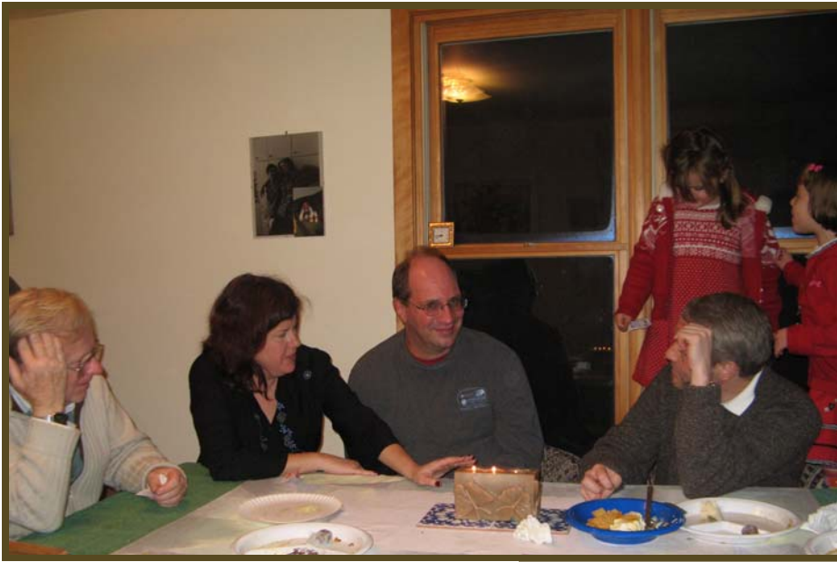
Solving the world's problems after dinner