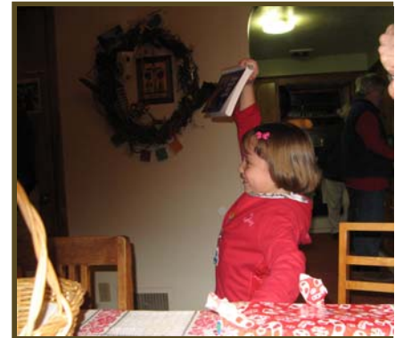
Yay! Dad finally got a cookbook!