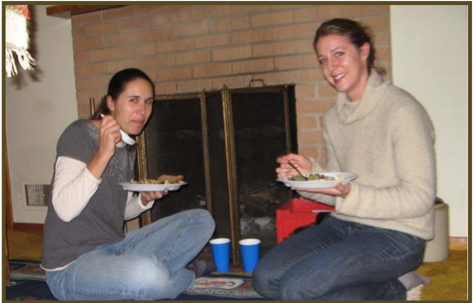
Table for two? Who needs a table?