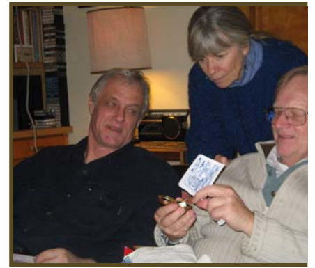
What did you get?