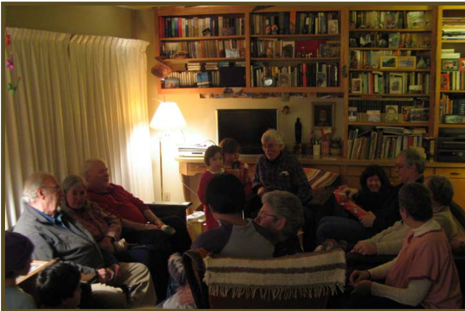
Feels like home, every year