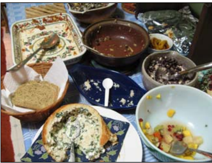
Time for dessert!

The meeting was quickly brought to a close, and a feast of food, conversation and good cheer enjoyed by all.