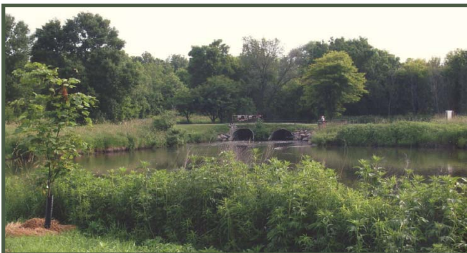
Token Creek County Park