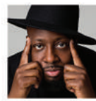
Wyclef Jean Acclaimed Artist & Producer Elevate Main Stage