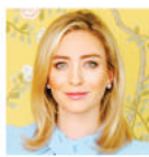
Whitney Wolfe Herd Bumble Elevate Main Stage