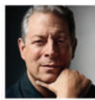
Al Gore Chairman, Generation Investment Management Elevate Main Stage