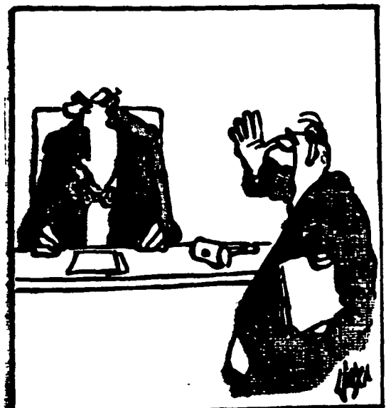
"See what happens when you find them not guilty?"